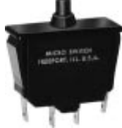
WW Page 92