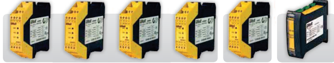
AD SRE3 AD SRE3C AD SRE4 AD SRE4C AD SRT AD SRO AD SROA